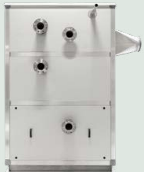
Enclosure HCP-1000 - seen from the top