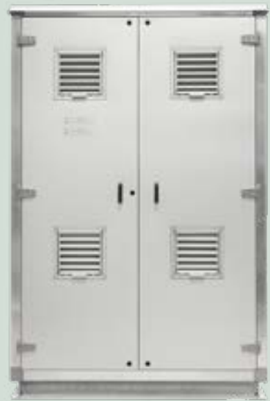
Enclosure HCP-1000 - seen from the end