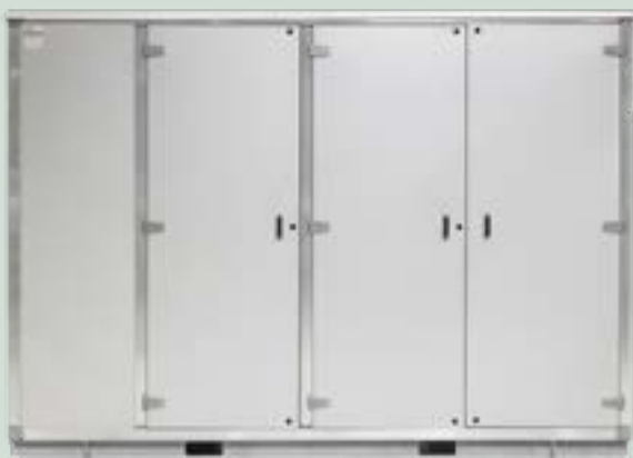
Enclosure HCP-1000 - seen from the front