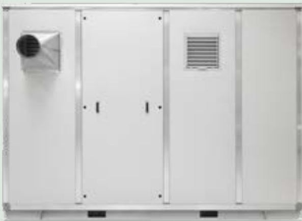
Enclosure HCP-1000 - seen from the back

The HCP-range systems are always delivered in a reach-in enclosure, which is suitable for both in- and outdoor installation. The enclosure is constantly ventilated with an EX-fan, which ensures negative pressure and maintains the right temperature in the cabinet. The enclosure has insulated walls with sound dampening panels.